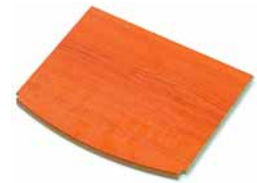
Shelves, 3 pcs.