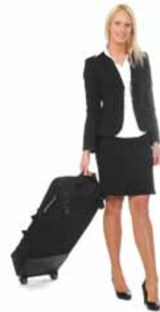
Extra Padded wheeled frame bag, Item IS-TC-01-MB